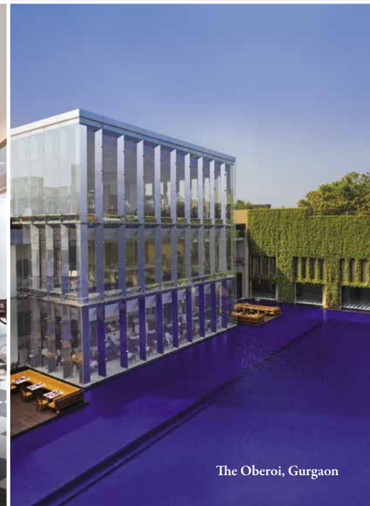
The Oberoi, Gurgaon