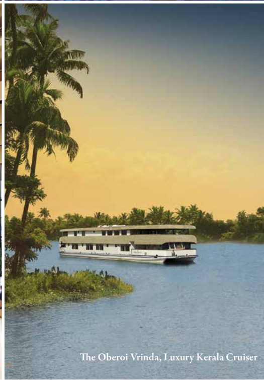
The Oberoi Vrinda, Luxury Kerala Cruiser