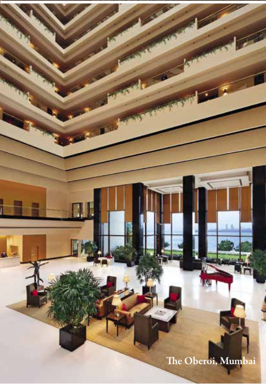
The Oberoi, Mumbai