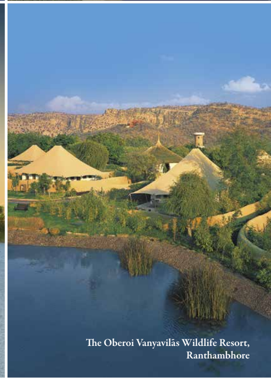
The Oberoi Vanyavilas Wildlife Resort, Ranthambhore