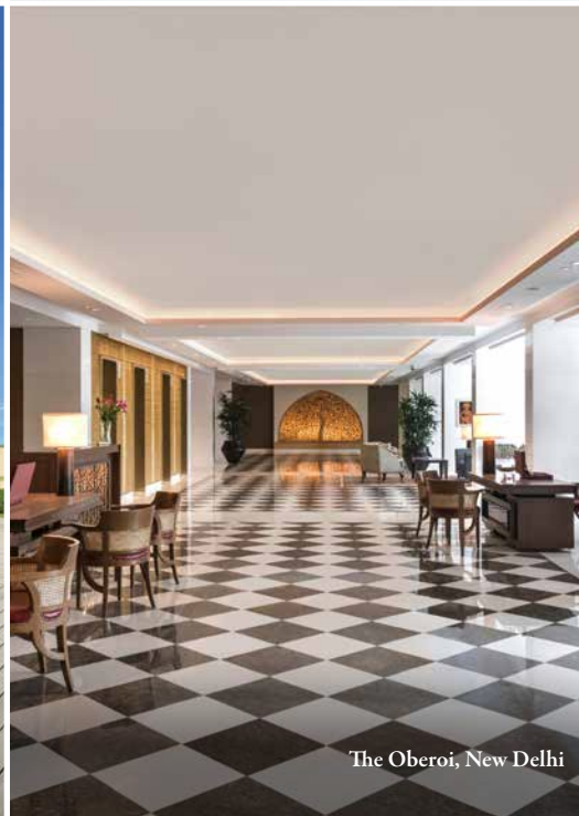
The Oberoi, New Delhi