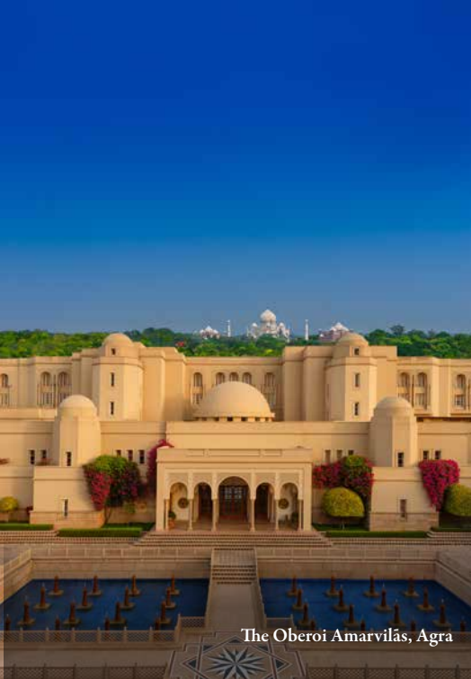
The Oberoi Amarvilas, Agra