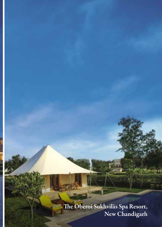
The Oberoi Sukhvilas Spa Resort, New Chandigarh