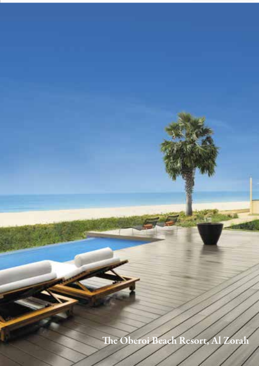
The Oberoi Beach Resort, Al Zorah