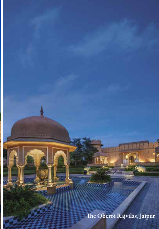
The Oberoi Rajvilas, Jaipur